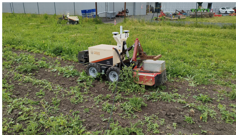
Figure 1.1: Mission presentation photo