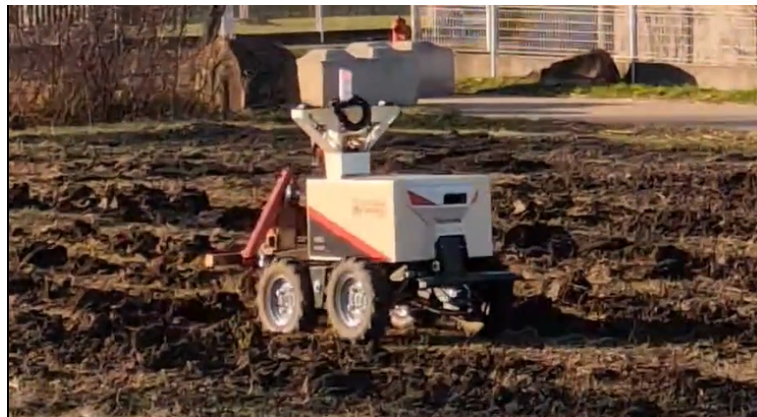
Figure 1.1: Mission presentation photo