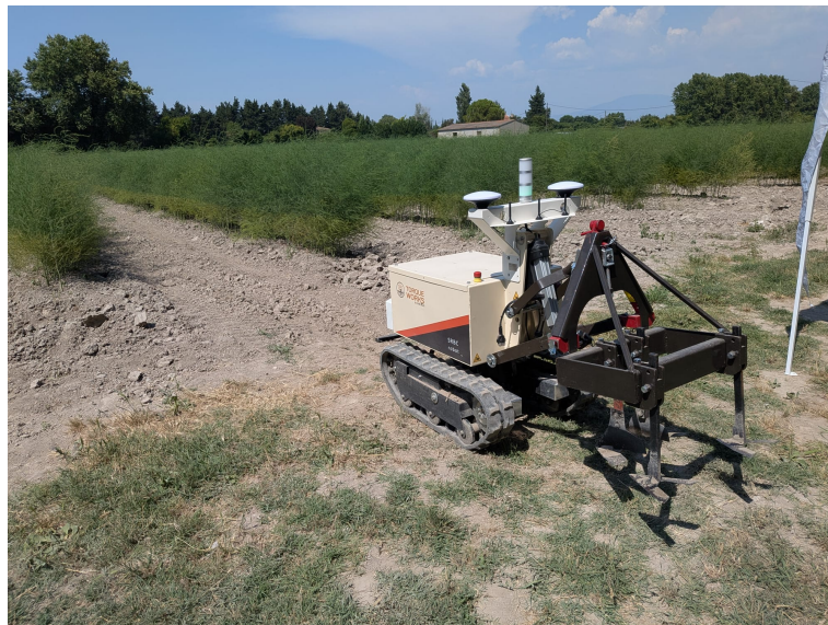
Figure 1.1: Mission presentation photo