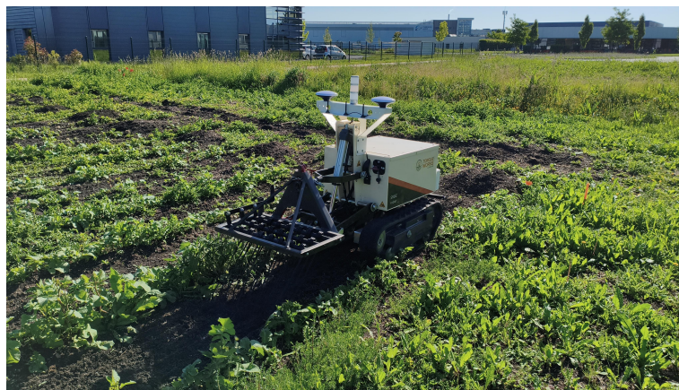
Figure 1.1: Mission presentation photo