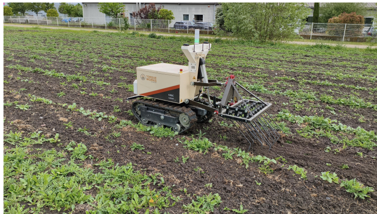
Figure 1.1: Mission presentation photo