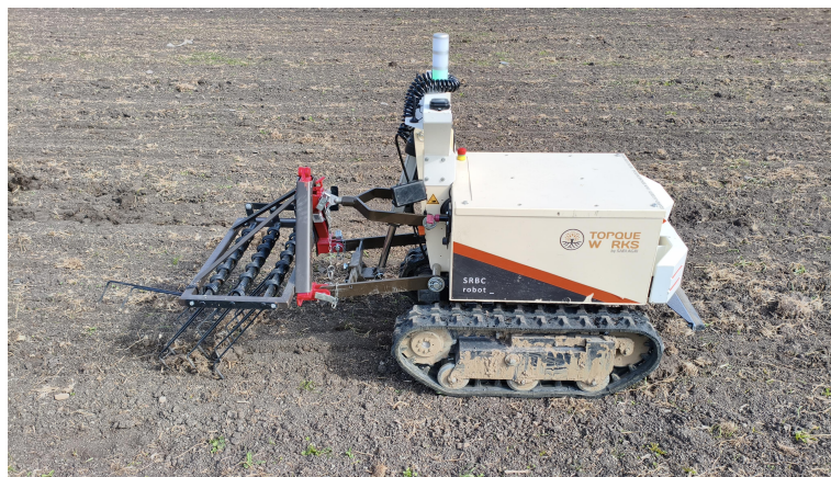
Figure 1.1: Mission presentation photo